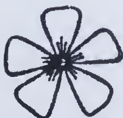
Figure 2. Emblem commonly used in the Journal and Proceedings of the Mueller Botanic Society .

The Natural History and Science Society of Western Australia became The Royal Society of Western Australia by Royal decree in 1913. But what of the new Society's crest? At the September 1915 meeting of The Society, the President A. Gibb Maitland proposed that a medallion or seal be designed for The Society. At the next meeting (12/10/1915) a design for a medallion or seal was received from Mr Gibb Maitland, and it was agreed to have a block made of the design, at the expense of the Society, for use on The Society's publications and notepaper. The block was received at the next meeting